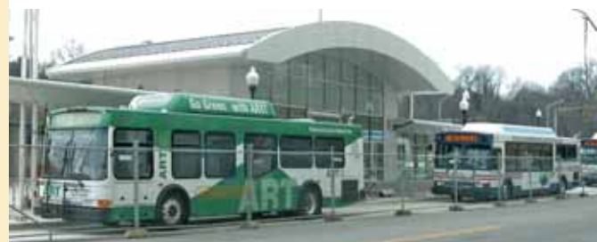
Buses practice pulling into the new station.

S hirlington Station, Arlington's first enclosed public bus station, is moving along at a steady pace. This station will serve as the principal transfer point for Metrobus and ART bus service and also house a Commuter Store. The station is located at the intersection of South Randolph Street and 31st Street South next to Shirley Highway (I-395), across from the Quincy Tower office building. Station opening is scheduled for late Spring. ■